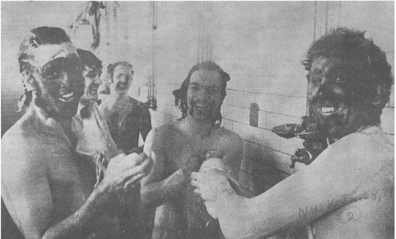
COAL MINERS, 1974