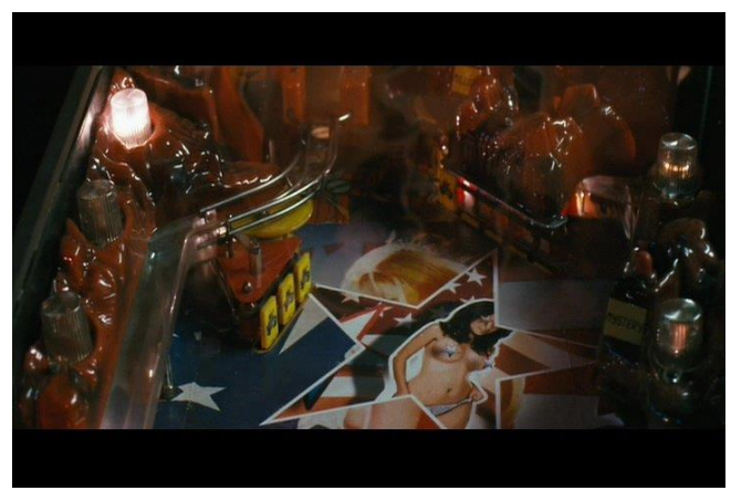
THE WHISTLEBLOWER IMPLICATES CULTURES OF MISOGYNY IN BOTH THE US AND BOSNIA IN THE PERPETUATION OF HUMAN TRAFFICKING.

with content extends into the classroom and, all too frequently, discussions of human rights films in high school and college are similarly limited to analyses of the issues raised by the narrative. Indeed, online lesson plans, like those provided by Amnesty International USA's Human Rights Education Program or the CCL Human Rights Film Awards, emphasize historical context and use films as case studies about particular atrocities or as opportunities to discuss more general human rights issues in relation to specific historical and/or geographical contexts. Within this framework, films are useful teaching aids to the extent that they help students identify certain rights and/or understand the contours of a particular historical case of human rights abuses.