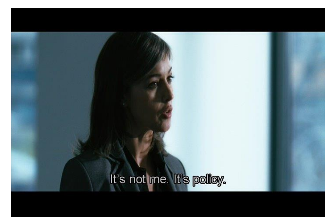
THE MONITORING FUNCTION OF THE UN AS WELL AS THE BUREAUCRACY OF INTERNATIONAL AID AGENCIES ARE SIMILARLY CONNECTED TO HUMAN TRAFFICKING.

question for students to answer, as they take human rights to be self-evident and transcendental concepts rather than historically constructed legal designations. I explain to students how the rights laid out in the UN Declaration evolved over the last few hundred years in response to shifting definitions of the self, revolutions in systems of government, and changing relationships to religious authority. My aim here is to challenge their assumptions about the universality of rights as well as to establish the critical approach that will frame our discussion for the next two days.