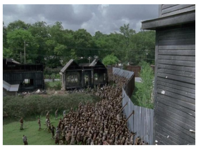
how, at the level of the collective unconscious, we (Americans, and others in neoliberal societies) might be trying to re-think our assumptions about human nature and the social contract at this particular moment; to imagine more meaningful connections and forms of membership. Might zombie productions be expressing a kind of dissatisfaction with how we relate to one another under current conditions, and a hope for alternatives?

Such scenes from The Walking Dead compel students to consider the notion of human "natural mutual hostility"at the heart of early social contract theory as an ahistorical myth. The class is also invited to consider whether TWD's dynamic picture of human behavior under apocalyptic conditions might suggest something about