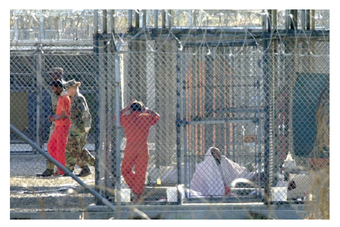
GUANTANAMO PRISONERS

he interdisciplinary field of human rights and literary studies has a broad historical and theoretical scope that carries significant pedagogical challenges. First, there is the challenge of teaching human rights as at once a dynamic juridical framework, one whose principles and effectiveness are subject to strenuous debate, and as salutary cultural discourse with widespread appeal. Second, we must understand violations in the longue durée of their geopolitical and historical contexts rather than see them as short, exceptional events. And, third, teaching human rights in the literature classroom may require fundamentally shifting student expectations. Students often come to the material with the assumption that literature is ennobling-that it will raise awareness of human rights abuses and generate sympathy for persons (real or imagined) who suffer those abuses. Thus, it can come as a surprise when we turn to literature and literary analysis for other purposes: not to foreclose exposure to the emotional weight of suffering and the perpetration of violence where it is represented, but to understand the narratability, limitations, and imaginative possibility of human rights stories. What kinds of stories and violations