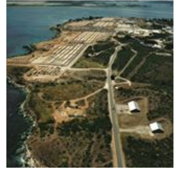
GUANTANAMO FROM THE AIR

inherent dignity of the human person," and that its ultimate goal is "to promote universal respect for, and observance of, human rights and fundamental freedoms." However, in the articles it immediately transitions into legal language, putting the power of recognizing and enforcing torture violations into the hands of "state parties." This rhetorical contradiction, of making the behind motivation the document one of personal human dignity, and yet putting ultimate power in the hands of institutions, leaves room for many of the legal arguments of the U.S. torture memos.