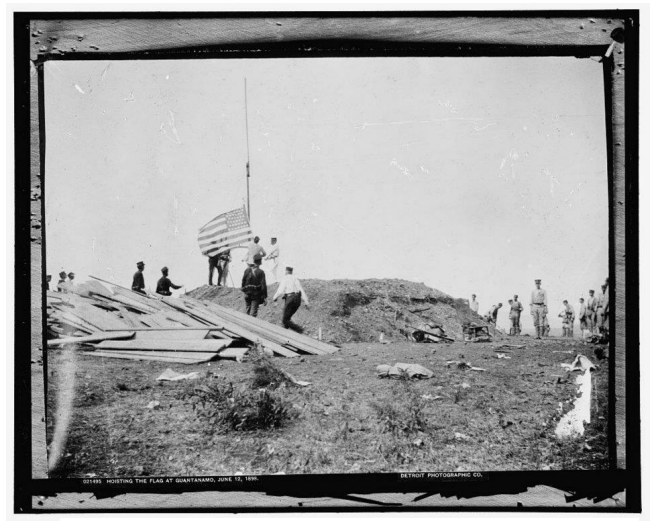
HOISTING THE U.S.FLAG AT QUANTANAMO ON JUNE 17, 1898