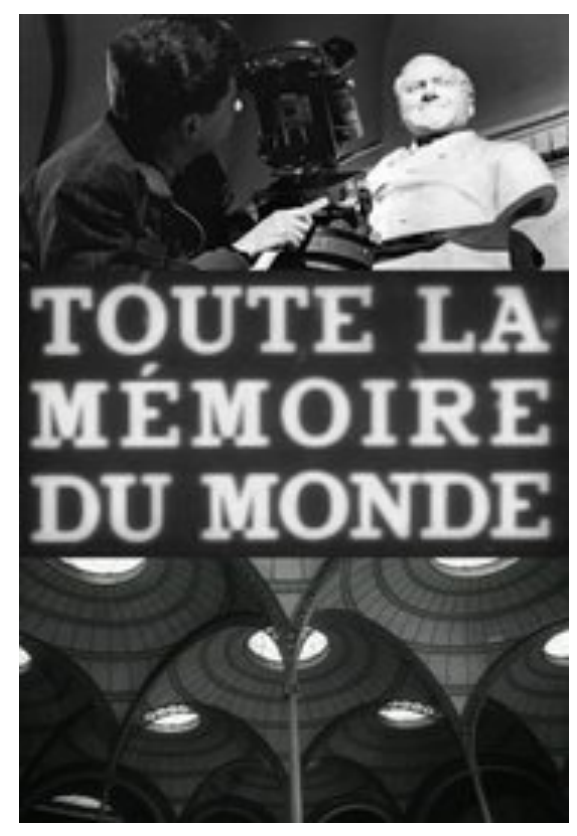
ALAIN RESNAIS' DOCUMENTARY FILM ABOUT THE FRENCH NATIONAL LIBRARY, ALL THE WORLD'S MEMORY (TOUTE LA MEMOIR DU MONDE)