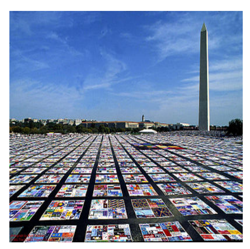
A DIFFERENT SORT OF ARCHIVE THE NAMES PROJECT AIDS QUILT