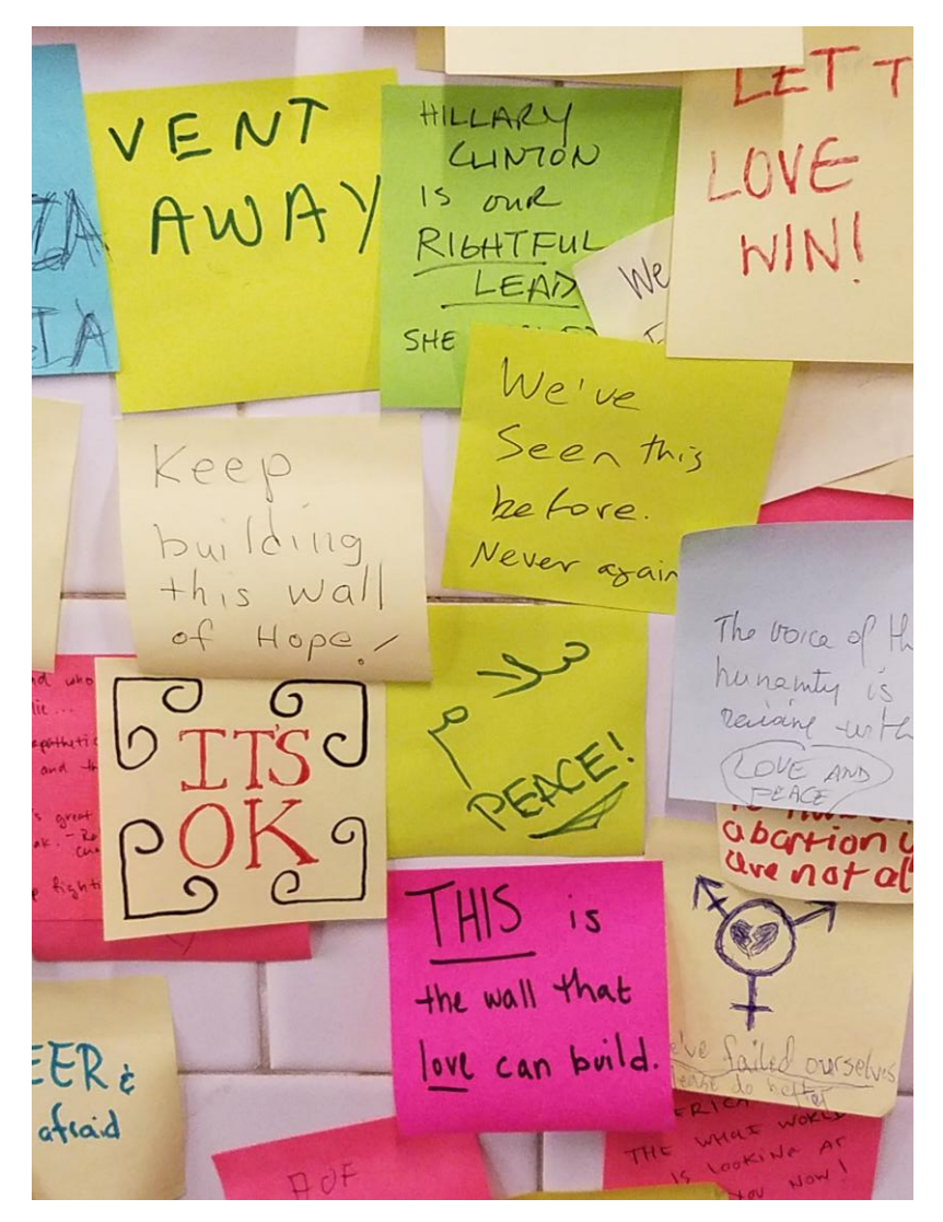
ANTI-TRUMP POST-ITS SUBWAY ART BY MATTHEW CHAVEZ, UNION SQUARE STATION, NEW YORK CITY