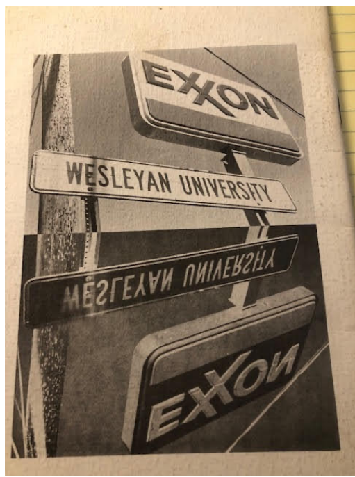
WESLEYAN UNIVERSITY PAMPHLET FRONT AND BACK COVERS. 1975

front cover locates Wesleyan in a tawdry landscape of gas stations and used-car lots, suggesting an institution up for sale, and not to the highest bidder. The back cover explicitly linked Wesleyan with Exxon, conveying the University's complicity, via stock ownership, with authoritarian and racist regimes – e.g., South Africa – and with energy companies implicated in the 70s energy crisis. Today's student demands for fossil fuel divestment by their universities clearly echo divestment campaigns of the 70s and 80s.