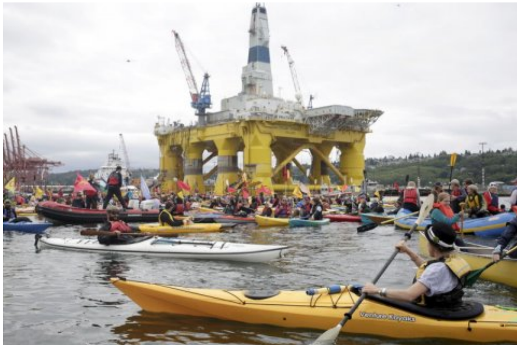
ACTIVISTS IN SEATTLE PROTESTING SHELL OIL'S POLAR PIONEER DRILLING RIG.

4. The threat of climate disaster will no doubt be with us for some time, and Radical Teacher welcomes other articles on how to teach about it.