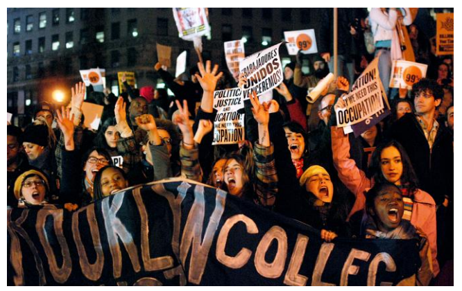
SEE RADICAL TEACHER'S RT 96 ( OCCUPY AND EDUCATION ) FOR PHOTO CREDIT.

The growth in public outcry on campuses and in congress about the debt spiral resonated and was coextensive with the larger public economic critiques made by the Occupy movement. Those protests began to receive national media attention with the widely-covered