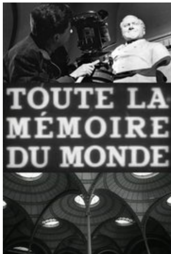
ALAIN RESNAIS' DOCUMENTARY FILM ABOUT THE FRENCH NATIONAL LIBRARY, ALL THE WORLD'S MEMORY (TOUTE LA MEMOIR DU MONDE)