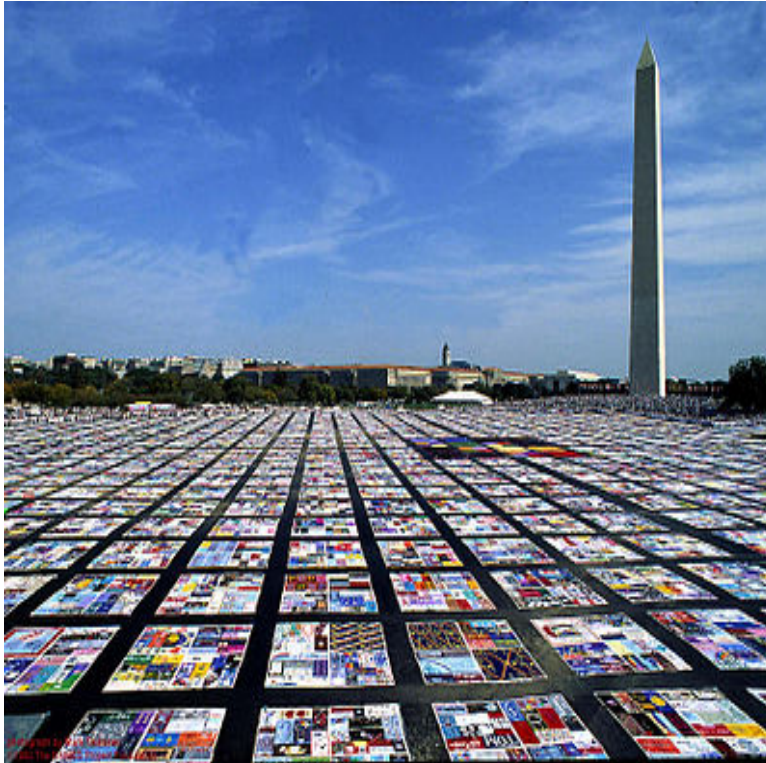
A DIFFERENT SORT OF ARCHIVE THE NAMES PROJECT AIDS QUILT