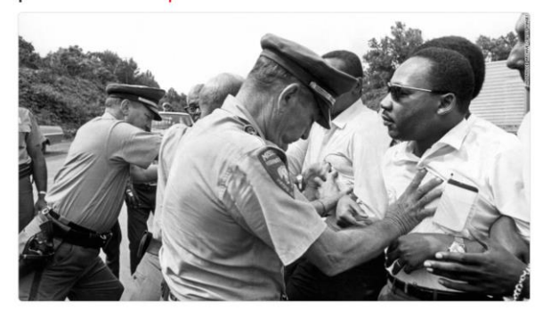
9:15 AM - 5 Apr 2017

If only Daddy would have known about the power of #Pepsi .