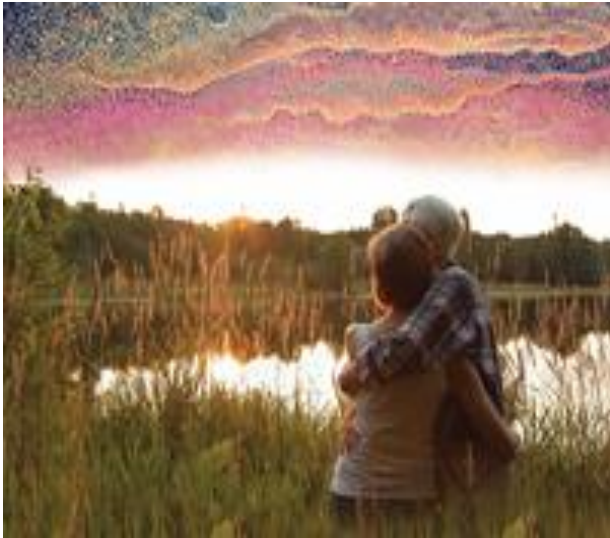
FROM THIS DAY FORWARD

From This Day Forward tells the story of a love, and family, that survived the most intimate of transformations.