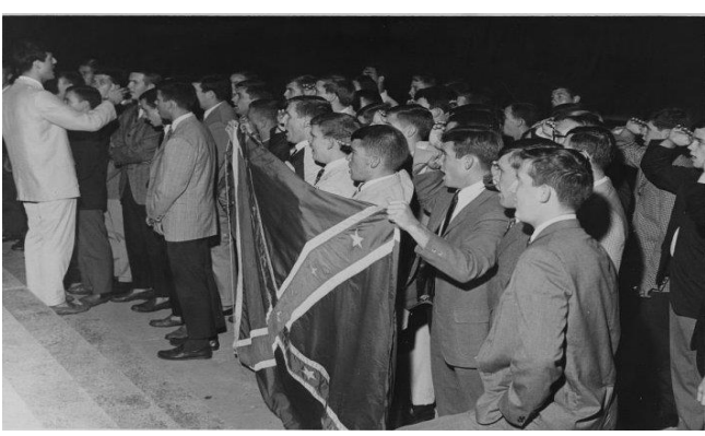
IMAGE 5. IN 2016 MEMBERS OF KAPPA ALPHA ORDER FRATERNITY AT TULANE UNIVERSITY (NEW ORLEANS) CONSTRUCTED "TRUMP'S WALL" ON THE FRONT PORCH OF THEIR FRATERNITY HOUSE. THIS PROVIDES AN INTERESTING JUXTAPOSITION OF KAPPA ALPHA ORDER BROTHERS AT A RALLY POSING WITH A CONFEDERATE FLAG ON THE CAMPUS OF EAST CAROLINA UNIVERSITY IN 1960.

This image, in particular, helped my students see a historical connection that also had a contemporary perspective.