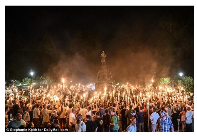
IMAGE 1. HUNDREDS OF WHITE NATIONALISTS RALLY AT THE THOMAS JEFFERSON STATUE ON THE CAMPUS OF THE UNIVERSITY OF VIRGINIA (FRIDAY AUGUST 11, 2017).

In 2017, this nation's discussion about the Confederate flag, monuments, and other racist structures reached a deadly but pivotal moment. On the weekend of August 11th to the 12th, 2017, far right and hate groups held a rally ("Unite the Right") in Charlottesville, Virginia to protest the city council's ruling to remove the Robert E. Lee monument located at Emancipation Park. Carrying tiki torches, on Friday evening, hundreds of neo-Nazis and White nationalists marched through the city as well as the campus of University of Virginia chanting racist and nationalistic slogans (See Image 1).