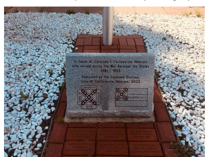
IMAGE 3. COLORADO'S SONS OF CONFEDERATE VETERANS MEMORIAL LOCATED AT RIVERSIDE CEMETERY (DENVER, CO) IS ON ONE OF SIX CONFEDERATE MEMORIALS IN THE STATE OF COLORADO.

In concert with the monument building campaigns across the country during the turn of the century, a Confederate monument was erected in Greenwood Cemetery in Canon City Colorado in 1899. Most recently, the Sons of the Confederate veterans installed a memorial at Riverside Cemetery in Denver in 2003 (see Image 3).