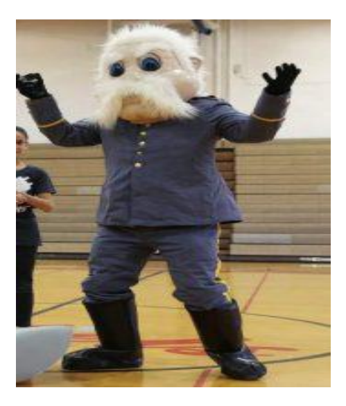
IMAGE 4. THE EATON HIGH SCHOOL "FIGHTING REDS" & THE WELD CENTRAL HIGH SCHOOL "REBELS" MASCOT. NOTE: THE WELD CENTRAL HIGH SCHOOL "REBEL" REBEL MASCOT REPRESENTED IN FILE ABOVE IS ALSO THE MASCOT OF WELD CENTRAL MIDDLE SCHOOL.

In wake of the tragic events in Charlottesville, combined with the climate both on campus and in the community, I thought it was important to provide an intellectual space to interrogate the literature on the Lost Cause and Confederate symbols. Students would have a chance to see how this theme is embedded physically and culturally into college campuses across the country.