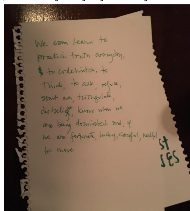
FIGURE 2: FROM TORONTO WORKSHOP

is—an online, well-designed receptacle holding a great deal of information— can be used for teaching and learning, but its online form leaves it (and us) complicit in the larger problem: mining and getting lost in digital minutiae