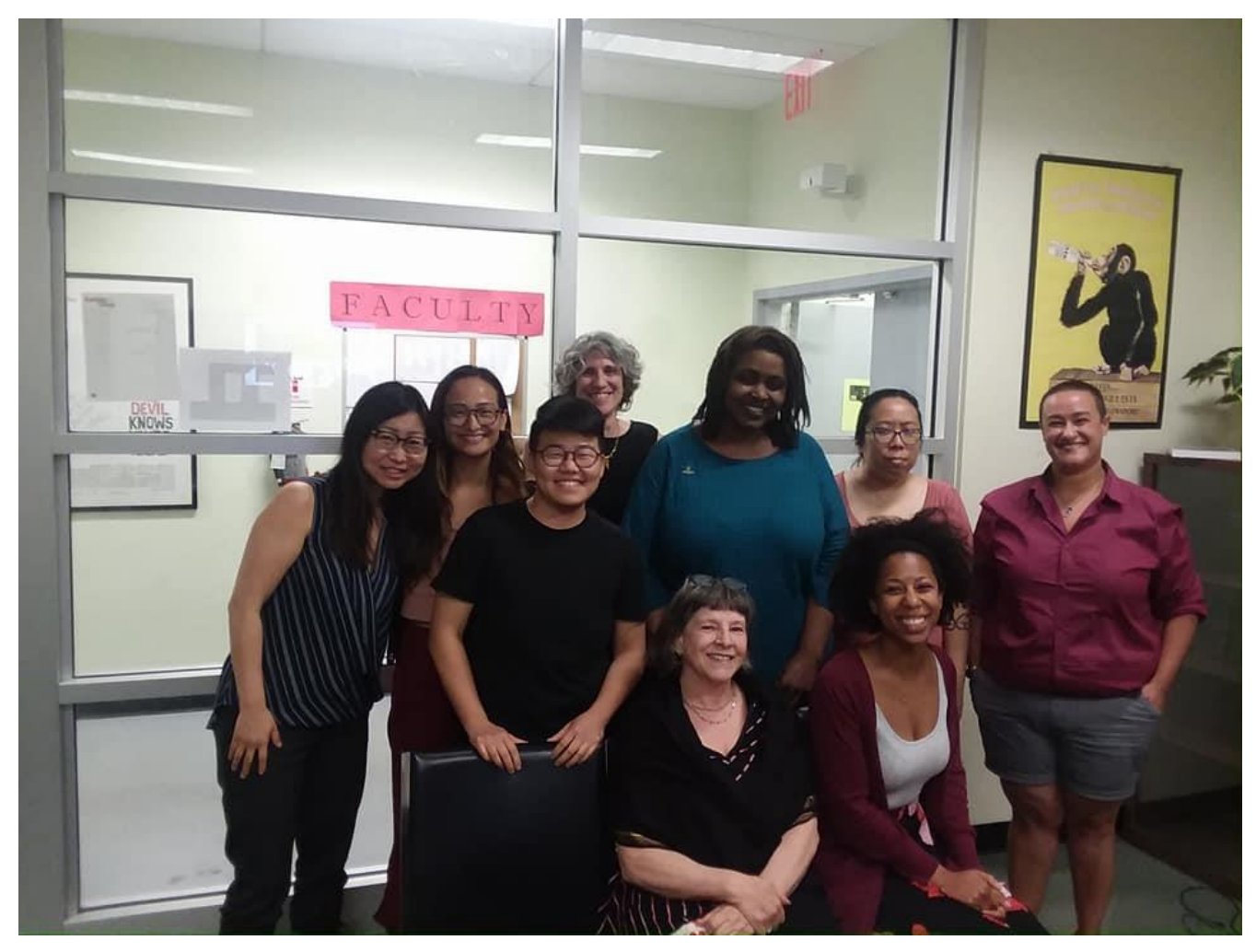
RACE AND RACISM POETRY WORKSHOP