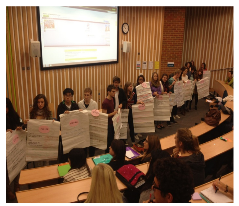
FIGURE 3. MAKING A TIMELINE

be described as "aid" under the definition of OA. Another slide showing the relative balance of remittance income, private investment, and development aid prompted us all to think about where money from outside a country goes, to what and to whom. I downloaded the spreadsheet with the UK Department for International Development's (DFID) aid spending for the previous year and crunched it on the big lecture theatre screen, highlighting the flows of resources to major consultancy consortia and the big global accountancy corporations. These pictures became artefacts for us to reflect on.