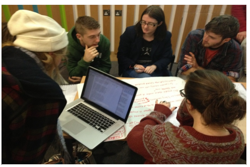
FIGURE 4. GROUP WORK, SITTING ON THE FLOOR IN THE AISLE OF THE LECTURE THEATRE

historical lens. We returned to themes raised earlier in the course about the nature of the aid relationship, the power of representations of development and their effects on racism and xenophobia in aid-giving countries, the ambiguities of the turn to "investing" in women's empowerment, the role of multinational corporations and their employment practices at home and abroad. Perhaps the most pertinent dilemma of all was that of whether aid does harm or good. Bringing into view the very possibility that something that is well intentioned might be a source of negative outcomes is challenging. But to consider, alongside this, whether it might be better to advocate for an end to aid altogether unsettles the very impulse to "assist" that underpins some of the most colonial dynamics of the business of aid.