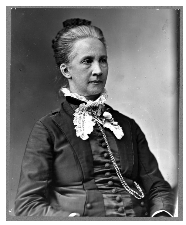
IN 1879, BELVA LOCKWOOD BECAME THE FIRST WOMAN ADMITTED TO THE U.S. SUPREME COURT BAR. THE SAME COURT, HOWEVER, REFUSED TO ISSUE A WRIT OF MANDAMUS ORDERING THE COMMONWEALTH OF VIRGINIA TO ADMIT HER TO THE BAR, THEREBY SETTING THE LEGAL PRECEDENT ALLOWING STATES TO LIMIT THEIR DEFINITION OF "PERSON" TO MALES ONLY.

Every law school has its own admissions trajectory and narrative, and the national aggregate data are very volatile and episodic. Schools did fine and no one couched the scoring in apocalyptic terms back in 1987-88 or 1994-2001, when there were fewer LSAT takers than there were in 2011-12 (130,000). [13] Many of these issues are interconnected, including the strength of the postbaccalaureate job market, perceptions about overall degree value and professional opportunities, international testtaking and immigration trends, and other features over which the legal education complex has little or no control. In volatile times, some schools lean into the wind and increase their size and even their number of locations, as did Cooley School of Law, while others downsize their student bodies, faculty, and staff. [14] Cruel fates await schools that guess wrong, in either direction, but I read these institutional responses as major differentiating features, not as evidence of convergence and uniformity.