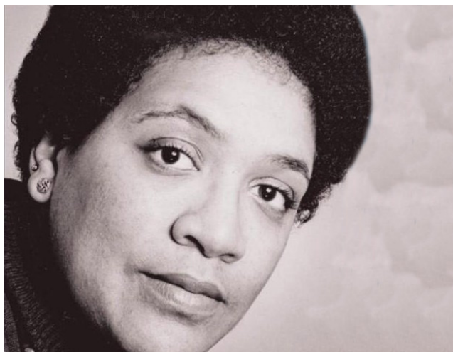
ADRIENNE RICH AND AUDRE LORDE