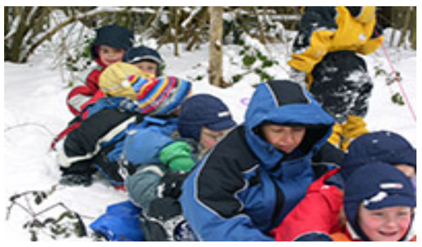
SCHOOL'S OUT: LESSONS FROM A FOREST KINDERGARTEN

Bullfrog Films has three new videos relevant for K-12 to college classrooms: