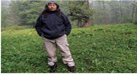
STANDING ON SACRED GROUND.

The special joint issue of Cultural Logic and Works & Days on the topic "Scholactivism: Transforming Praxis Inside and Outside the Classroom" has become a double issue with an extension of the deadline for proposals to October 1, 2014 and a complete paper deadline to June 1, 2015. To request a call for papers or to submit a proposal, email jgramsey@gmail.com .