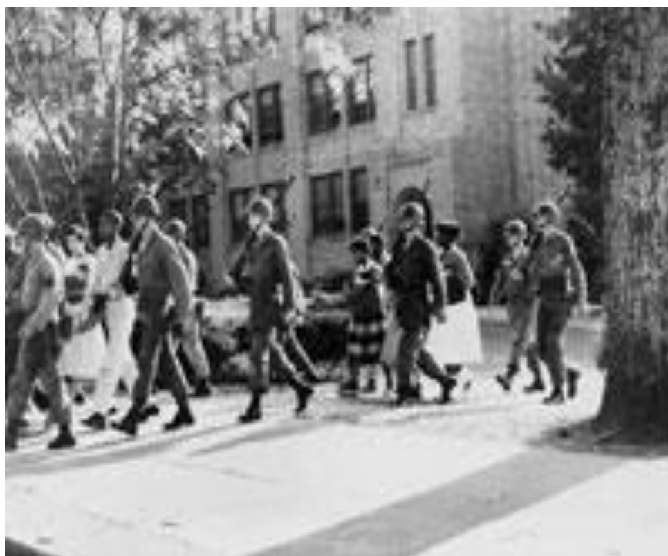
U.S. TROOPS ESCORT AFRICAN AMERICAN STUDENTS FROM CENTRAL HIGH SCHOOL, LITTLE ROCK, ARKANSAS, OCTOBER 3, 1957.