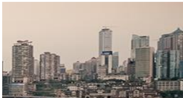
THE HUMAN SCALE.

Bullfrog Films has two new films usable in either schools or colleges. In The Human Scale , influential Danish architect Jan Gehl argues that we can build cities in a way which takes human needs for inclusion and intimacy into account. 50% of the world's population lives in urban areas, and by 2050 it will be 80%. Cities have become the primary human habitat. According to Gehl, if we are to make cities sustainable and livable for people we must re-imagine the very foundations of modern urban planning. Rather than examining buildings and urban structures themselves, Gehl and his team meticulously study the in-between spaces of urban life, the places where people meet, interact, live, and behave.