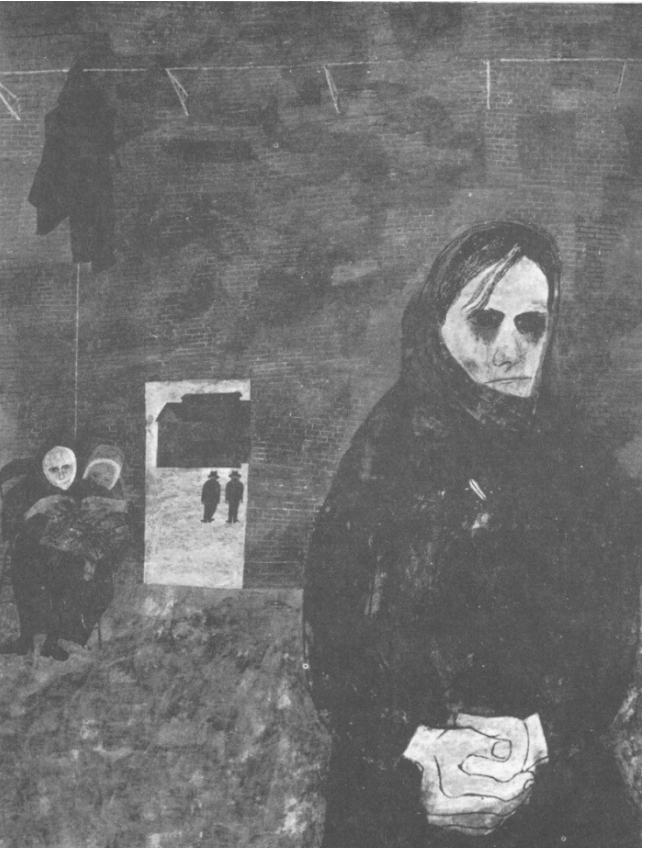
MINERS' WIVES BEN SHAHN

Some of the poems by the Colorado miners and their allies, namely Poems of Struggle , form a significant group because they call upon miners to unite in action against their oppression. <sup>15</sup> These are fighting poems, as "The Battle Song of the Toilers" illustrates in its title, and call workers to "Take arms in the cause of freedom/and fight for home and right." Although the battle call of this poem is partly metaphoric, the revolutionary theme in other poems of this genre is made more explicit by allusions to comparable situations, such as the expulsion of oppressive invaders by the Bedouins in Kearney's "A Pariah's Prayer" and the warning to the rich and idle – "Beware thou! of the insurrectionary flame;/Know thou that such as this our patriot fathers saw" – in Dagenhart's