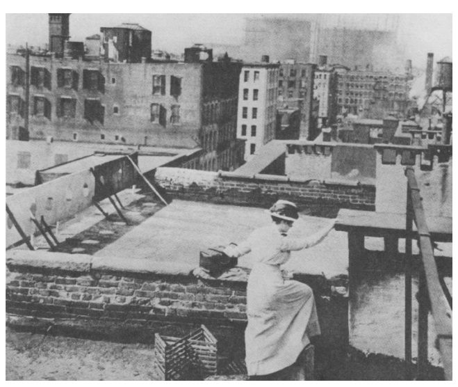
VISITING NURSE, NEW YORK, 1902

First, we need a broader definition of what we can call "literature." That working-class literature has often taken