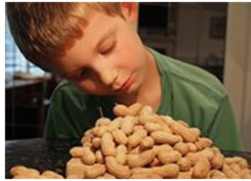
THE ALLERGY FIX

The Allergy Fix explores the science behind the tripling in childhood food allergies over the last twenty years.