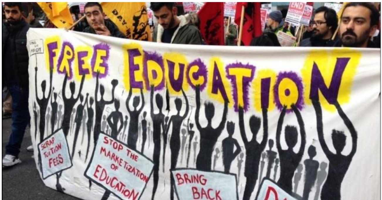
TWITTER LSE STUDENTS' UNION