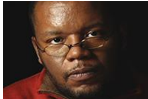
A FRAGILE TRUST

A Fragile Trust: Plagiarism, Power, and Jayson Blair at the New York Times tells the story of Jayson Blair, the most infamous serial plagiarist of our time, and how he unleashed the massive scandal that rocked the entire world of journalism.