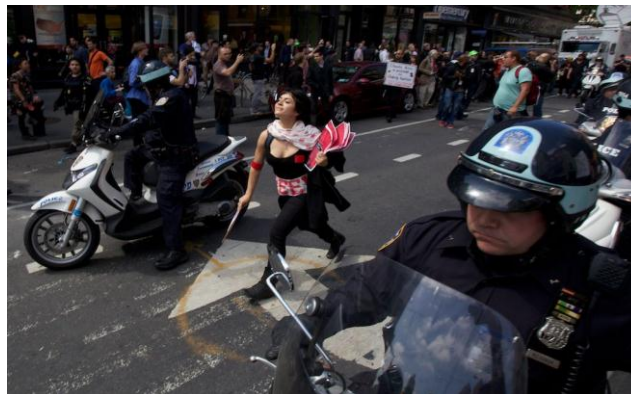
THE AUTHOR ON MAY DAY

A teacher and ally recently asked me to write about what led me to become a student activist. The readily available answer is Occupy Wall Street (OWS). I spent time at Zuccotti Park, participated in discussions and general assemblies, and joined several marches. I watched people old enough to be my parents and young enough to be my nephews assaulted for chanting and demonstrating, for protecting each other, for making street art and telling strangers very kind and empowering things, for giving everyone who asked food, clothing and shelter. I witnessed and became attuned to the reality that people of color are targets for state-issued violence. I learned that debt—student debt and other forms of debt—are forms of indenture, orchestrated for the wealth of the 1%. During that most colorful American Autumn, 2 it was difficult to convince myself that I still had to go to class, to write papers, to do a little tap dance so all my teachers would keep me afloat in the silent and mechanized world of a corporate education.