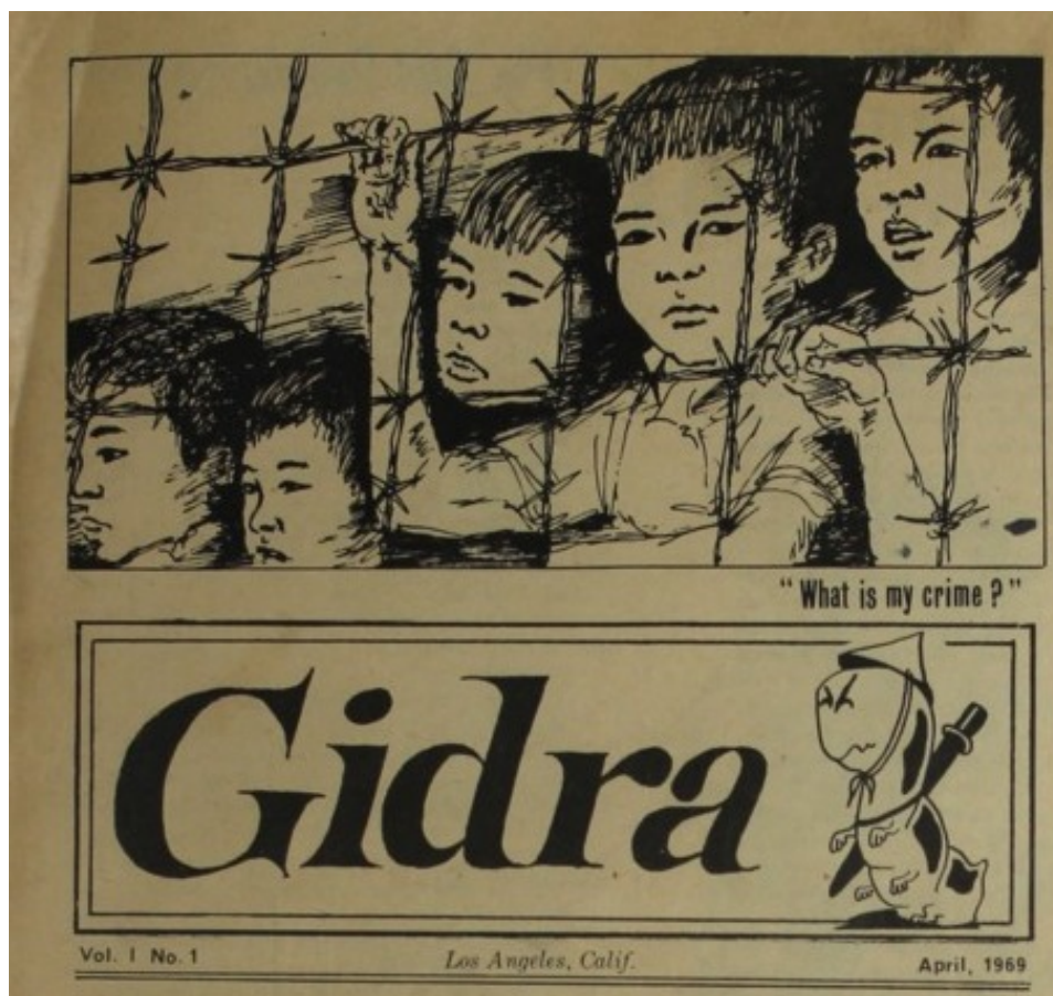
FIGURE 1. GRAPHIC FROM THE COVER OF THE FIRST ISSUE OF GIDRA