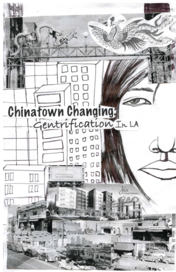
FIGURE 7. CLASS ZINE PROJECT ENTITLED "CHINATOWN CHANGING: GENTRIFICATION IN LA"

Overall, the students responded enthusiastically to the community zine project and appreciated how the assignment provided what one student called "a solid understanding of how to use zines to contribute to social activism and community building." Another student commented that working collaboratively on a community-based zine helped her to more thoroughly understand the participatory aspect of zine culture, especially in regards to being more intentional about the types of community materials that were included in the zine and being mindful about the relationship between content and form in how the zine is presented. All the students expressed their gratitude for being able to hear the "genuine testimonials" of the Chinatown community, which gave them a clearer portrait of how gentrification affects low-income ethnic neighborhoods. Furthermore, many students remarked how the project allowed them to move beyond the abstraction of theory to understanding the issues on a