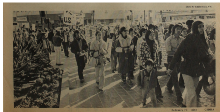
FIGURE 3. PHOTOGRAPH FROM GIDRA DEPICTING COMMUNITY ACTIVISM IN LITTLE TOKYO

how Asian Americans organized forms of grassroots resistance to protest these changes. This discussion underscores the importance of student participation in social justice campaigns and the struggle against capitalist redevelopment that decimate economically disenfranchised communities. Topically this is relevant for their community project that focuses on gentrification in Los Angeles Chinatown. Gidra provides an example of how to employ various aesthetic strategies to depict controversies around corporate development and community mobilization against top down “urban renewal.” [See Figures 2 and 3] By creating these linkages, students are challenged to conceive of the archive as a living history—rather than a static and isolated repository—and in so doing, apply their knowledge from the archive to community action as part of their community zine project.