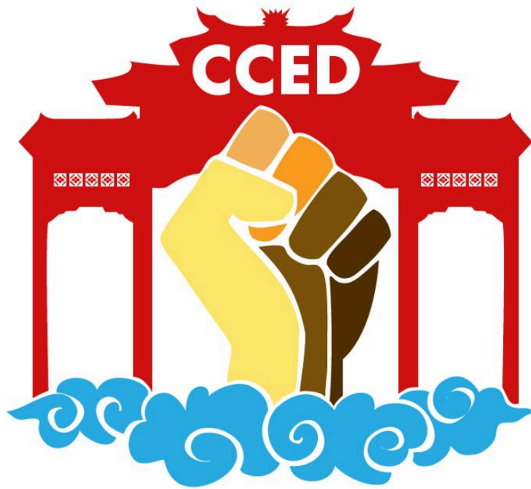
FIGURE 4. CCED LOGO

CCED is a multiethnic, inter-generational community organization made up of activists, residents, small business owners, workers, youth, and friends of LA Chinatown. [See Figure 4] CCED was founded in 2012 in response to Walmart's controversial plans to develop in Chinatown, a move that many in the community believed would have detrimental effects on the residents and businesses in Chinatown. According to the mission statement on the CCED website ( www.ccedla.org ), CCED's goal is to build grassroots power with low-income and immigrant communities to preserve the integrity of LA Chinatown as a vibrant and diverse ethnic and cultural space, where everyone is valued for their talents and contributions to the larger community. Through organization, education and mutual help, CCED seeks to revitalize a thriving Chinatown with good jobs for residents, clean recreational spaces, affordable housing, and accessible education. Currently, CCED is the only Chinatown grassroots organization to organize, mobilize, and create a presence in LA Chinatown that is opposed to residential and business redevelopment and the destruction of its traditional character.