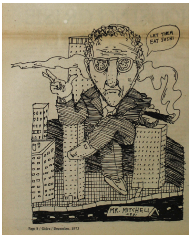
FIGURE 2. ILLUSTRATION FROM GIDRA DEPICTING CORPORATE DEVELOPMENT IN LITTLE TOKYO