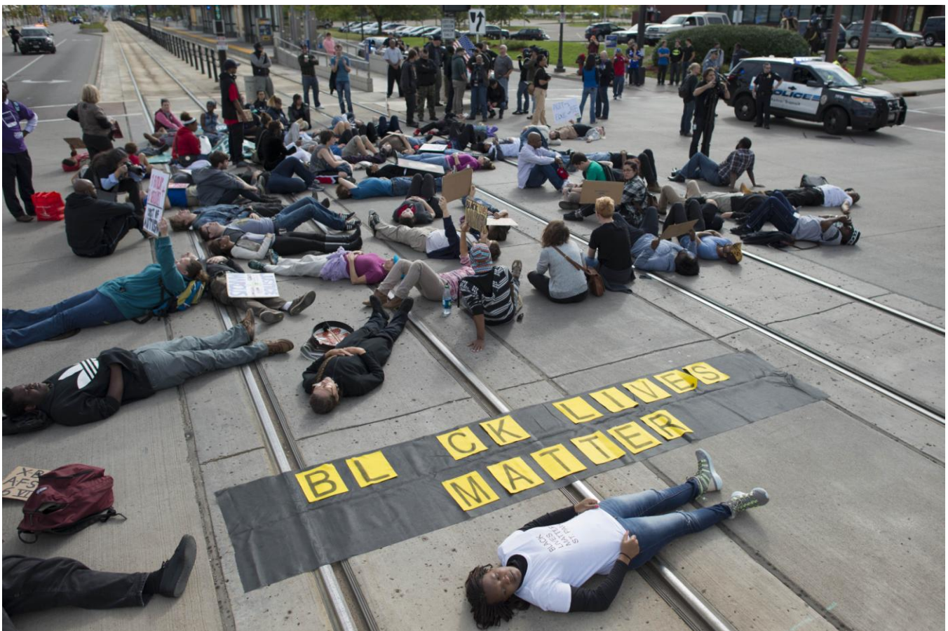
BLACK LIVES MATTER DIE-IN PROTESTING ALLEGED POLICE BRUTALITY IN SAINT PAUL, MINNESOTA, SEPTEMBER 20, 2015.