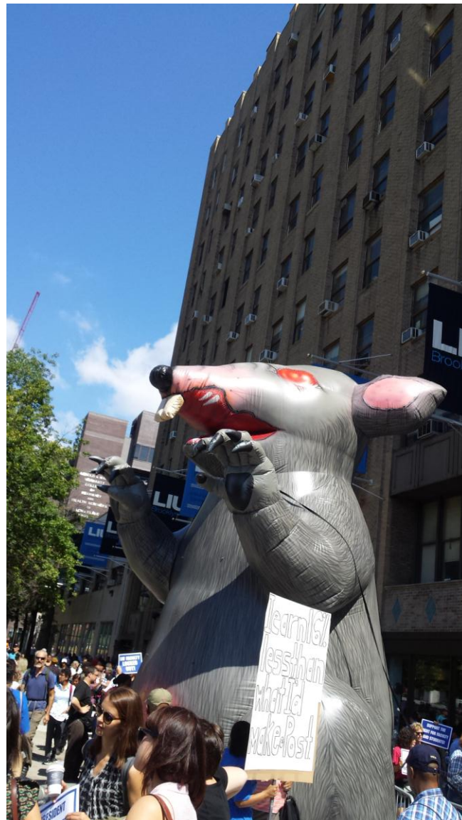
LONG ISLAND UNIVERSITY/BROOKLYN LOCKOUT