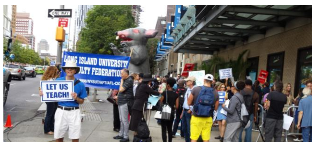
LONG ISLAND UNIVERSITY/BROOKLYN LOCKOUT

In "A Turning Point for the Charter School Movement" ( Truthout , August 30, 2016), a battle over charter schools in Massachusetts is seen as a microcosm of the charter school debate across the country. Massachusetts Democrats passed a resolution opposing charter school expansion and said the pro-charter school campaign is "funded and governed by hidden money provided by Wall Street executives and hedge fund managers." Across the country, public sentiment against charter schools has appeared in the form of the NAACP and The Movement for