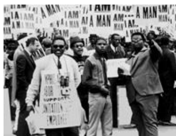
LOVE & SOLIDARITY

Love & Solidarity: James Lawson & Nonviolence in the Search for Workers' Rights is a 38-minute documentary