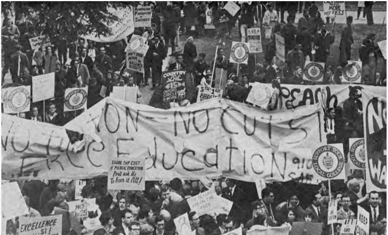
"TWO PHOTOGRAPHS FROM 1969 DEMONSTRATION," COURTESY OF CUNY DIGITAL HISTORY ARCHIVE