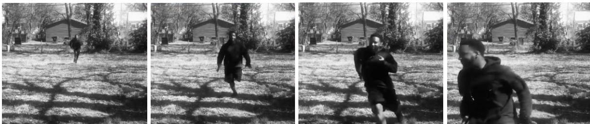
SERIES OF SCREENSHOTS OF A MAN PARTICIPATING IN THE #GETOUTCHALLENGE. IMAGES FOUND ON VIDEO, "STEPHEN CURRY NAILS THE GET OUT CHALLENGE! #GETOUTCHALLENGE." SOURCE: SUPER CELEBRITY WORLD YOUTUBE CHANNEL, PUBLISHED MARCH 9, 2017: HTTPS://WWW.YOUTUBE.COM/WATCH?V=21WXWWFNDLG . ACCESSED DECEMBER 29, 2017.

We next tied the realm of healthcare and well-being to our relationship with the environment. Here, many students were introduced for the first time to phrases like