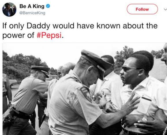
9:15 AM - 5 Apr 2017 SCREENSHOT OF REV. BERNICE KING'S TWEET IN REACTION TO A PROTEST-THEMED PEPSI COMMERCIAL STARRING KENDALL JENNER. ACCESSED DECEMBER 29, 2017.

One woman discussed the airing of and backlash against the protest-themed Pepsi commercial starring model Kendall Jenner, asking the class, "Are these innocent advertising mistakes or components of a bigger racial issue?" Her peers responded with thoughtful commentary about how they believed colorblindness contributed to the tone-deafness and misappropriation of #BlackLivesMatter protests, which were believed to be the commercial's source of inspiration. Another woman discussed artist Kara Walker's gargantuan sugar sculpture, Sugar Baby 3 —a 'Mammy-Sphinx' with protruding breasts and genitalia, asking her peers whether some Black artists' critiques about Walker's "extreme" stereotypical images in public spaces might be understood as a form of racial policing.