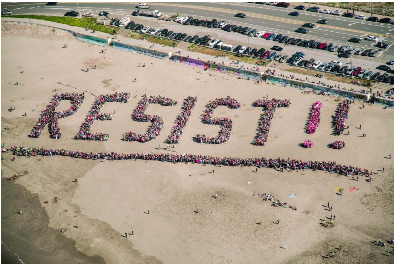
THOUSANDS OF PEOPLE STAND TOGETHER TO SEND A MESSAGE TO THE NATION. SAN FRANCISCO'S OCEAN BEACH. FEBRUARY 11, 2017.