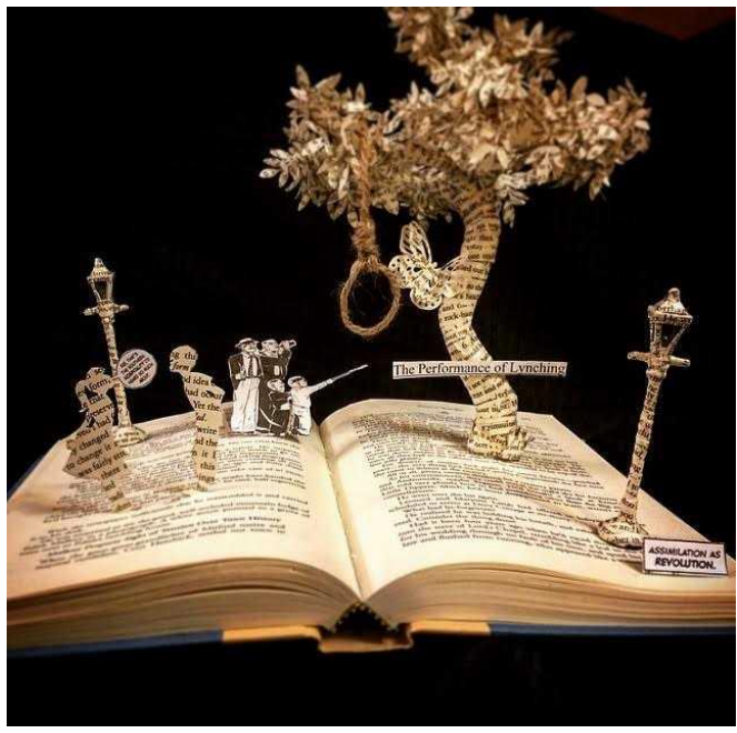
PERFORMANCE OF LYNCHING NO. 1 AND 2, HEATHER GIBSON COOK