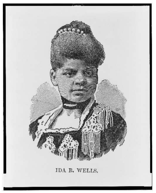
PORTRAIT OF IDA B. WELLS, 1891