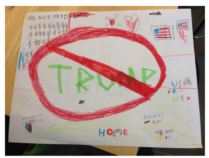
FIGURE 3. CHILD'S PROTEST SIGN.

Referencing other forms of political resistance that the children had studied in addition to murals, Emily remarked that the chant sounded like something one would hear at a protest. This prompted some children to begin making actual signs to carry with them in the real world. One showed four stick figures holding hands with the word "freedom" beside it. Above them, the word "Trump" was written in bright orange marker, with a circle around it and an X going through the middle. In another sign, Trump's name was written in large green capital letters with a red circle around it and a red line across it. Surrounding the central image were American flags, hearts, stars, and words including "home," "equality," "bad," and "good." The image also incorporated phrases that they had used in their play, such as "he needs to learn" and "everyone has the same heart" (see Figure 3). Another group of children began writing a letter with bulleted ideas representing what they would want say to him, including "US is the home of Mexicans too" and "People have the same hart (heart)."