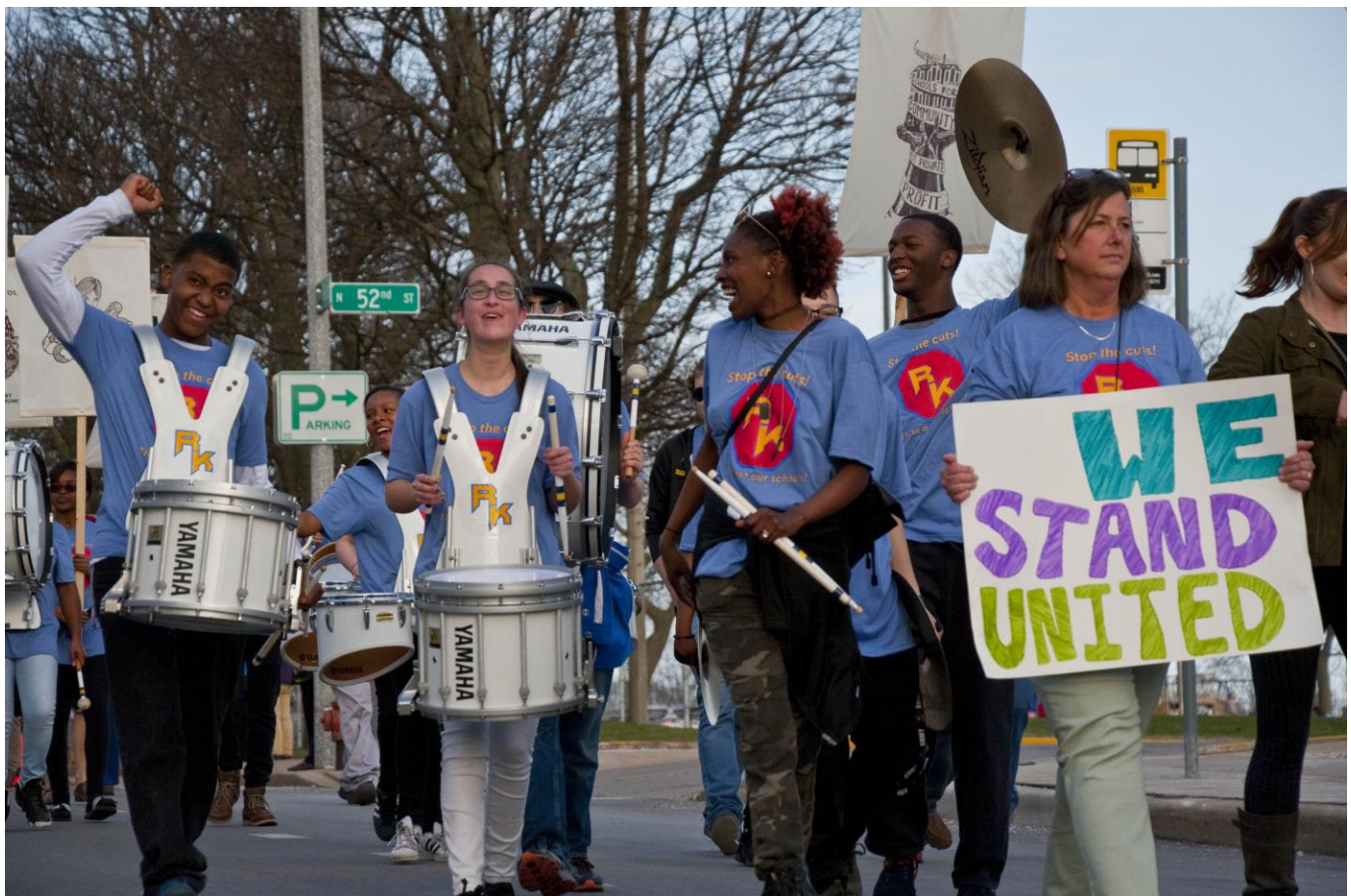
MILWAUKEE PUBLIC SCHOOLS TEACHER DEMONSTRATION APRIL 24, 2018.