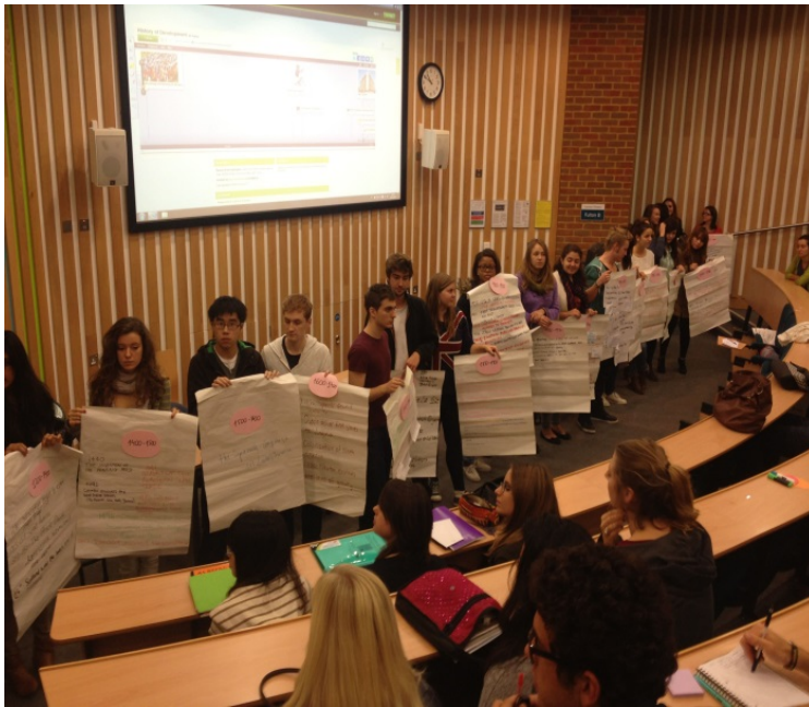
FIGURE 3. MAKING A TIMELINE

be described as “aid” under the definition of OA. Another slide showing the relative balance of remittance income, private investment, and development aid prompted us all to think about where money from outside a country goes, to what and to whom. I downloaded the spreadsheet with the UK Department for International Development’s (DFID) aid spending for the previous year and crunched it on the big lecture theatre screen, highlighting the flows of resources to major consultancy consortia and the big global consultancy corporations. These pictures became artefacts for us to reflect on.