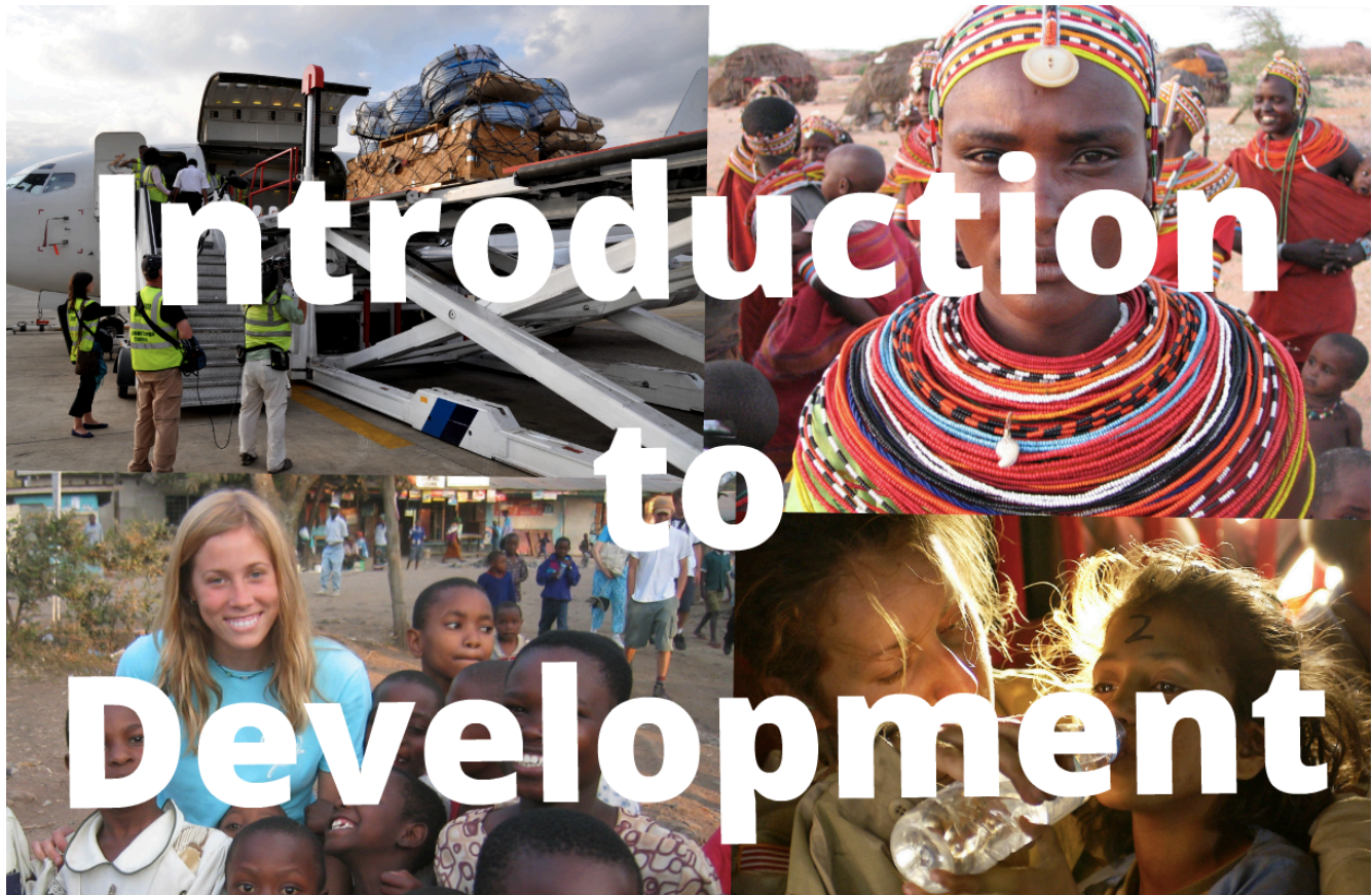
FIGURE 1: OPENING SLIDE WITH FAMILIAR TROPES FROM DEVELOPMENT AGENCY "POVERTY PORN"