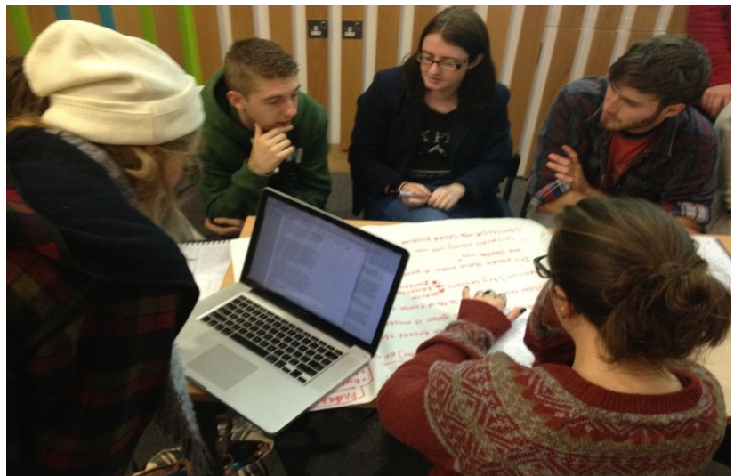
FIGURE 4. GROUP WORK, SITTING ON THE FLOOR IN THE AISLE OF THE LECTURE THEATRE

Sessions on NGOs, social movements, and the private sector completed the round of “actors.” The next step was to take a series of “development dilemmas” and look at them through a critical historical lens. We returned to themes raised earlier in the course about the nature of the aid relationship, the power of representations of development and their effects on racism and xenophobia in aid-giving countries, the ambiguities of the turn to “investing” in women’s empowerment, the role of multinational corporations and their employment practices at home and abroad. Perhaps the most pertinent dilemma of all was that of whether aid does harm or good. Bringing into view the very possibility that something that is well intentioned might be a source of negative outcomes is challenging. But to consider, alongside this, whether it might be better to advocate for an end to aid altogether unsettles the very impulse to “assist” that underpins some of the most colonial dynamics of the business of aid.