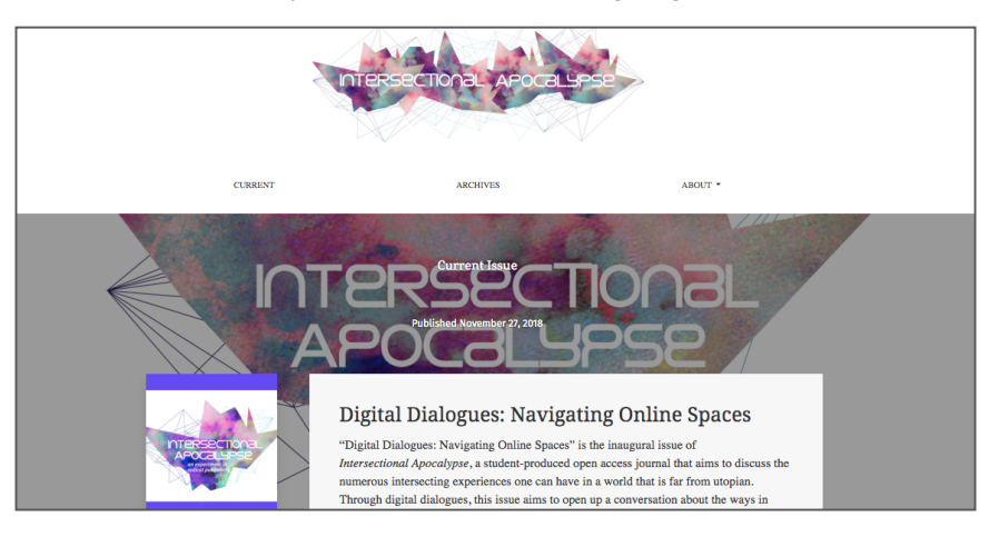
FIGURE 1: A SCREEN CAPTURE FROM THE OPENING PAGE OF THE JOURNAL, WHICH THE STUDENTS COLLECTIVELY DEVELOPED ON OJS, TITLED INTERSECTIONAL APOCALYPSE . AVAILABLE ONLINE AT: HTTPS://JOURNALS.LIB.SFU.CA/INDEX.PHP/IFJ.

Their solution to developing a networked and nurturing model of a workshop-based peer review involved asking contributors to also act as reviewers. While this sounds simple, it was modeled on imagining what both authors and