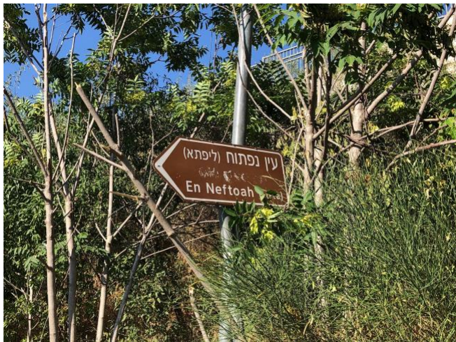
IMAGE: DIRECTIONAL SIGNAGE TO THE VILLAGE OF LIFTA IN HEBREW, ARABIC, AND ENGLISH. ARABIC IS ENTIRELY ERASED BY VANDALISM.

One of the first issues this course sought to explore was the lived experience of settler colonialism. As mentioned, the first day of the travel study began with a tour of Lifta by Zochrot. As we waited together looking out onto the ruined village, largely overgrown, many locals passed us to head down to the natural springs for a summer outing. We looked over a map of the total number of erased communities in Israel (now available for all classrooms globally as an iNakba app). One student who had conducted research on Native American curriculum in Wisconsin asked: "Do Israelis know to ask questions like who lived here before, based on the education system?"